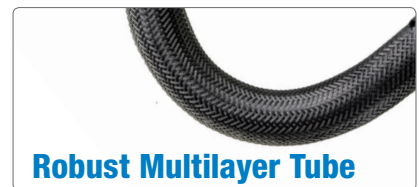
Robust Multilayer Tube